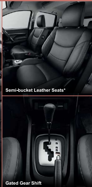
Semi-bucket Leather Seats*