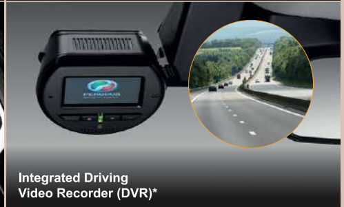
Integrated Driving Video Recorder (DVR)*