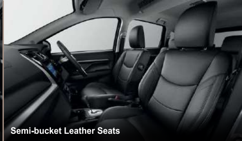
Semi-bucket Leather Seats