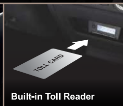
Built-in Toll Reader