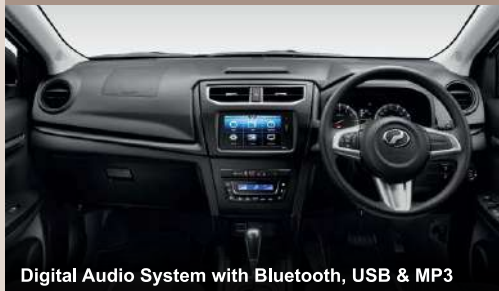
Digital Audio System with Bluetooth, USB & MP3