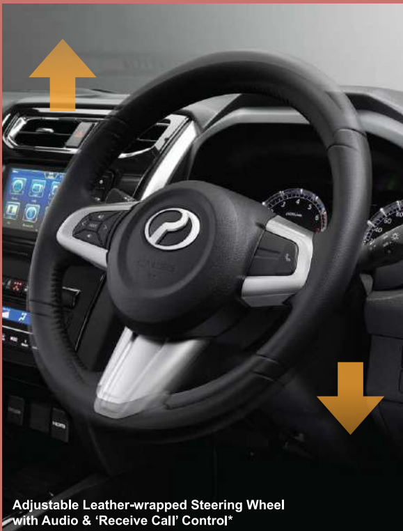
Adjustable Leather-wrapped Steering Wheel with Audio & 'Receive Call' Control*