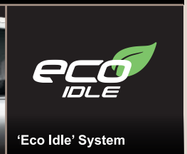
'Eco Idle' System