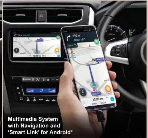
Multimedia System with Navigation and 'Smart Link' for Android*