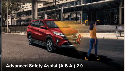
Advanced Safety Assist (A.S.A.) 2.0