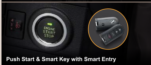
Push Start & Smart Key with Smart Entry