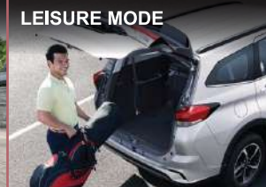
Load it up and pack it in.