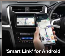
'Smart Link' for Android