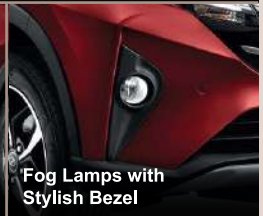
Fog Lamps with Stylish Bezel