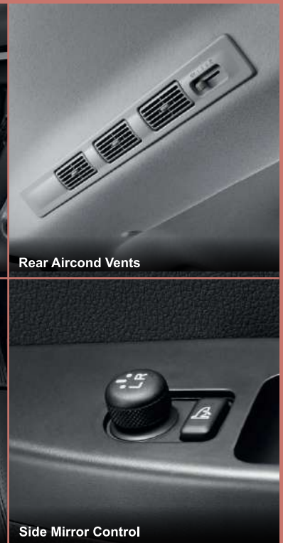
Rear Aircond Vents