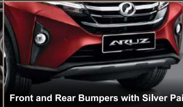
Front and Rear Bumpers with Silver Painted Diffuser