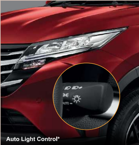
Auto Light Control*