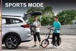
Pack it all in for weekend adventures.