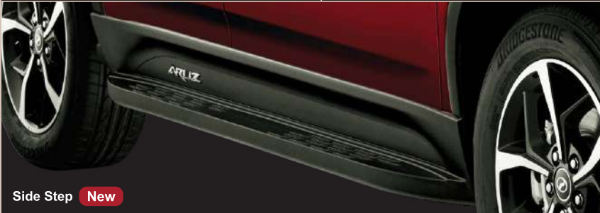
Side Step New