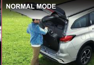
More room for more stuff.