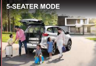
Road trips are always better with your loved ones.