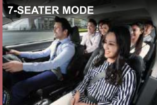
When you just need 2 more.