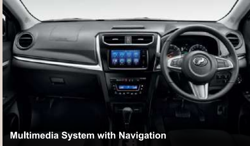
Multimedia System with Navigation