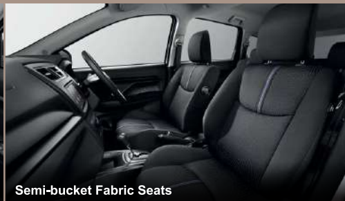
Semi-bucket Fabric Seats